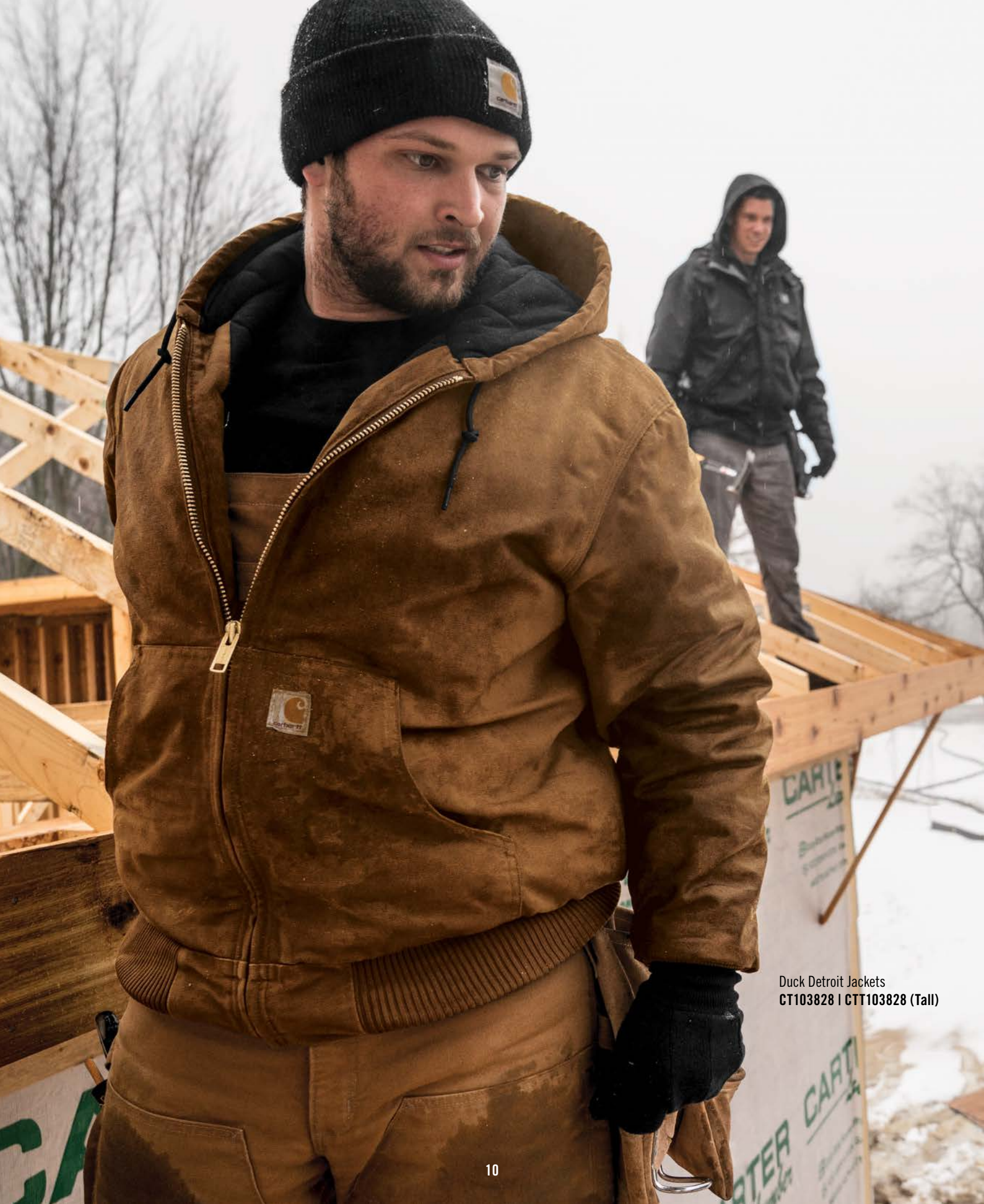
Duck Detroit Jackets CT103828 | CTT103828 (Tall)