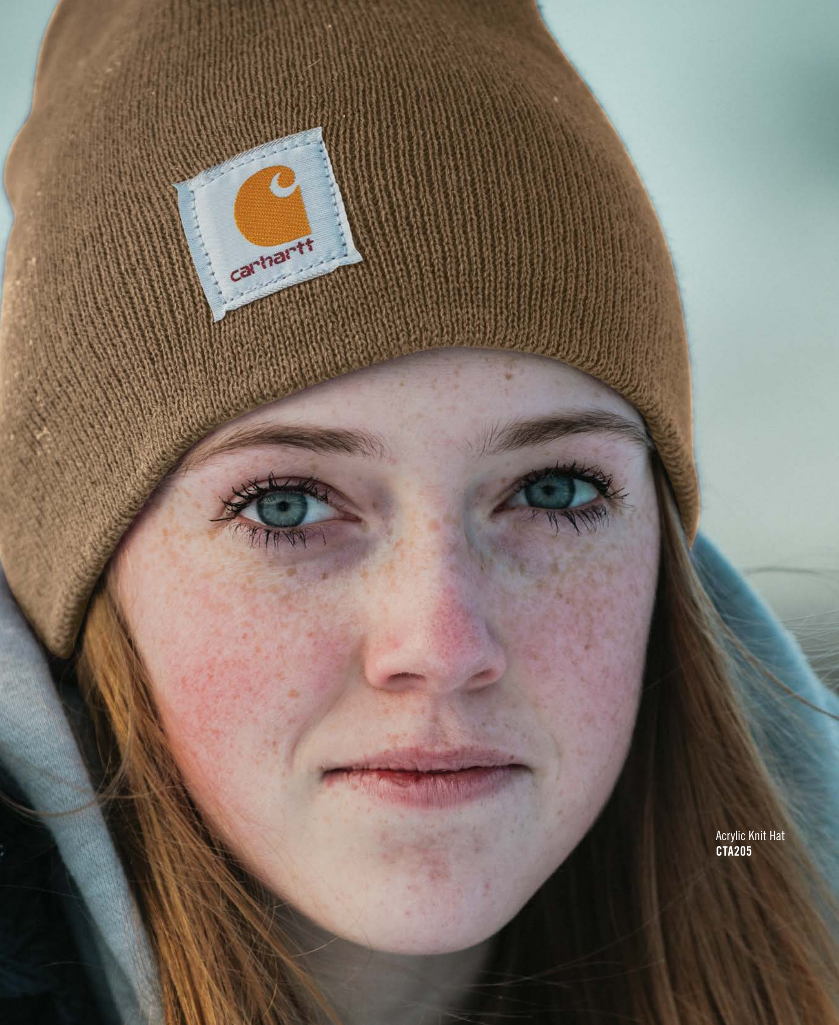
Acrylic Knit Hat CTA205