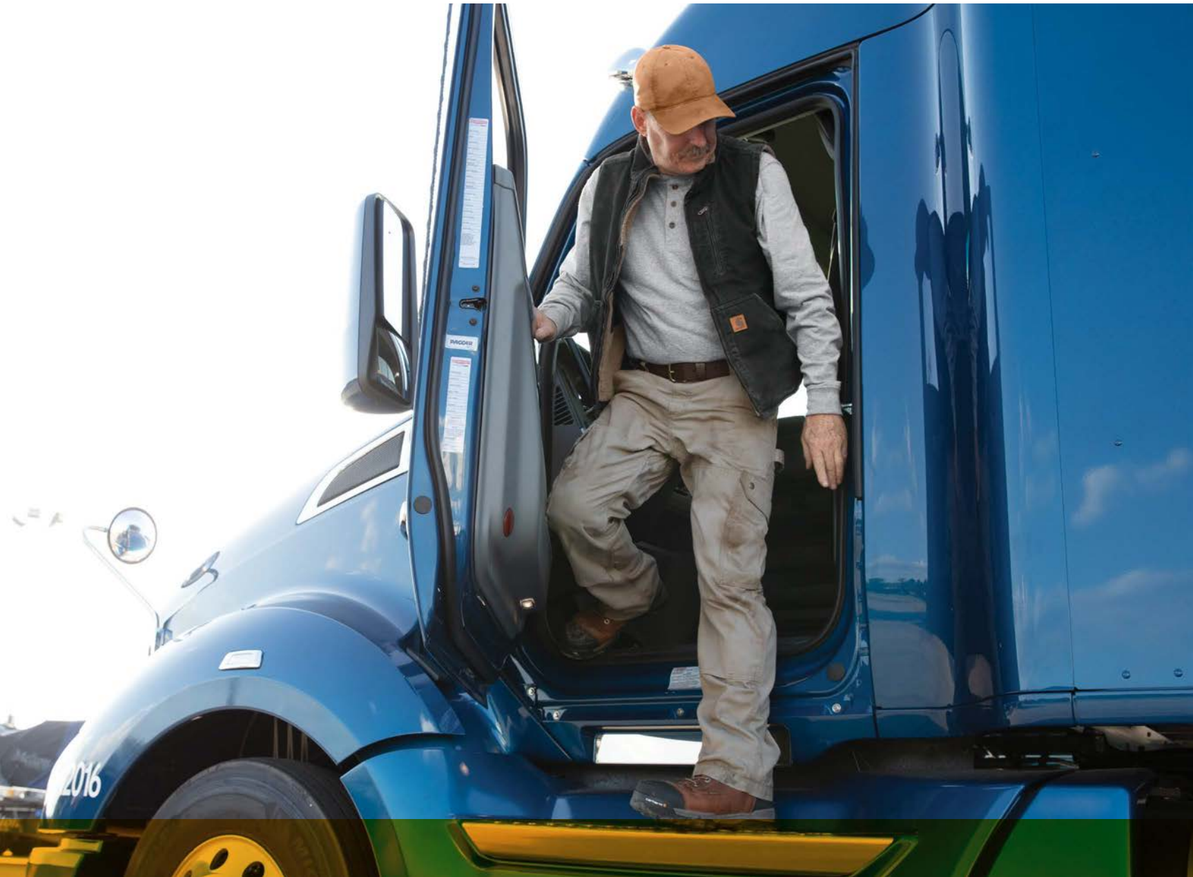
Long Sleeve Henley T-Shirt CTK128