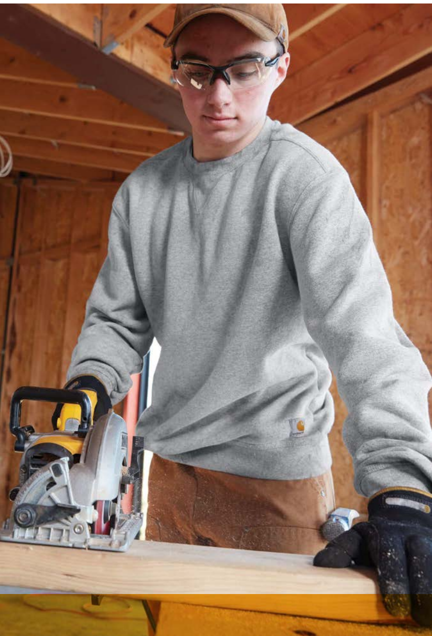
Midweight Crewneck Sweatshirt CTK124