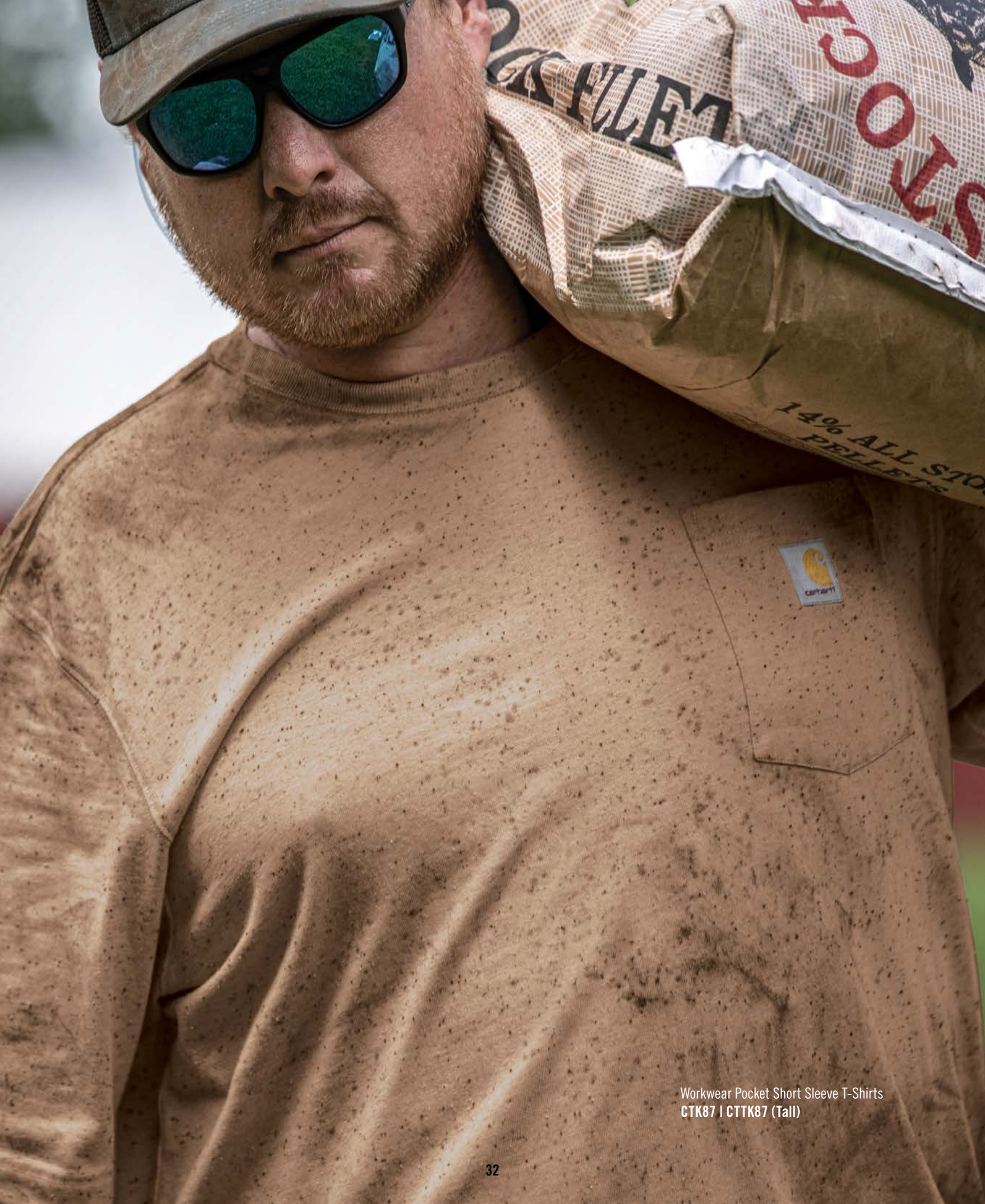
Workwear Pocket Short Sleeve T-Shirts CTK87 | CTTK87 (Tall)