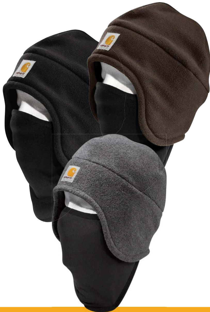
Fleece Hat CTA207