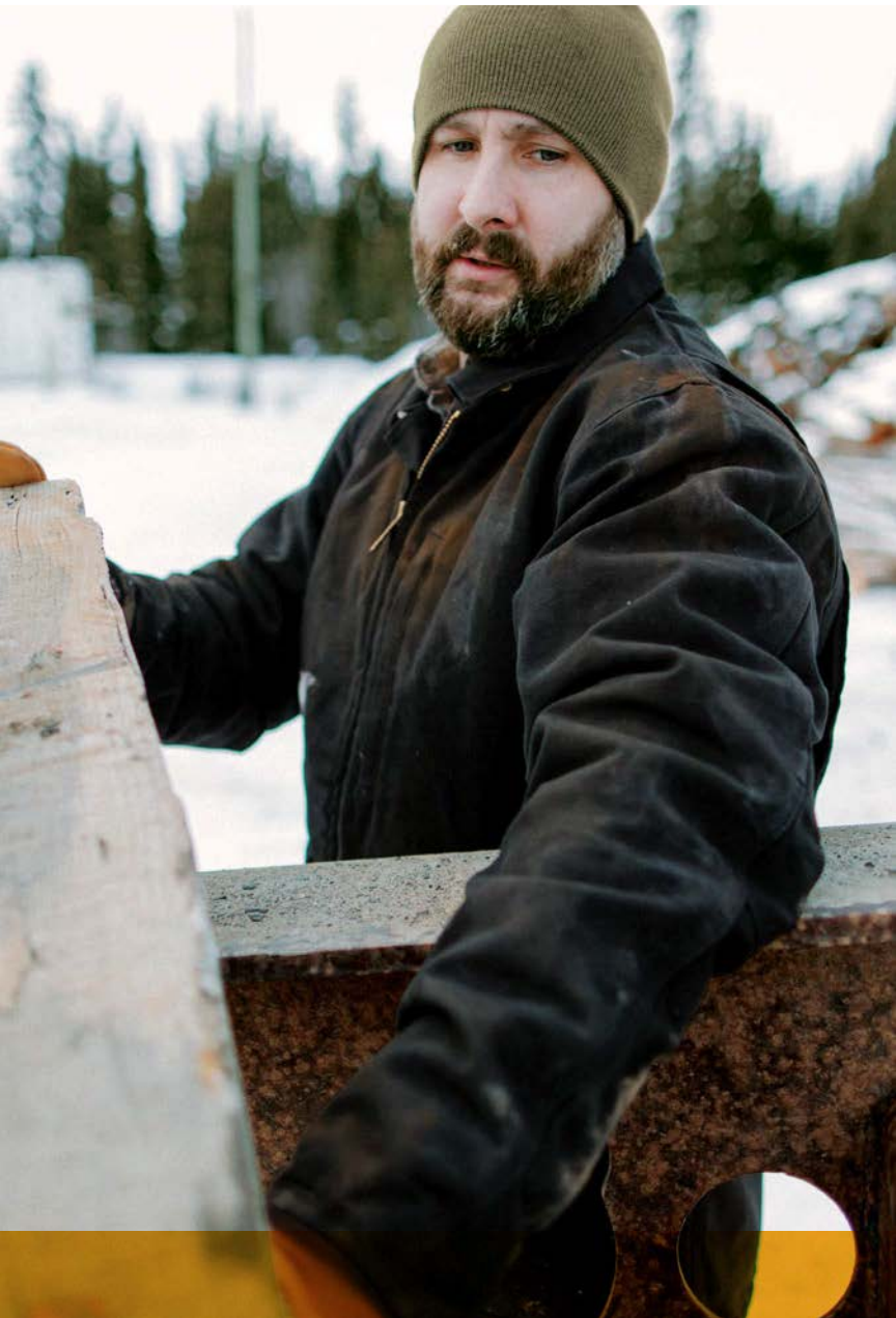
Sherpa-Lined Coats CT104293 | CTT104293 (Tall)