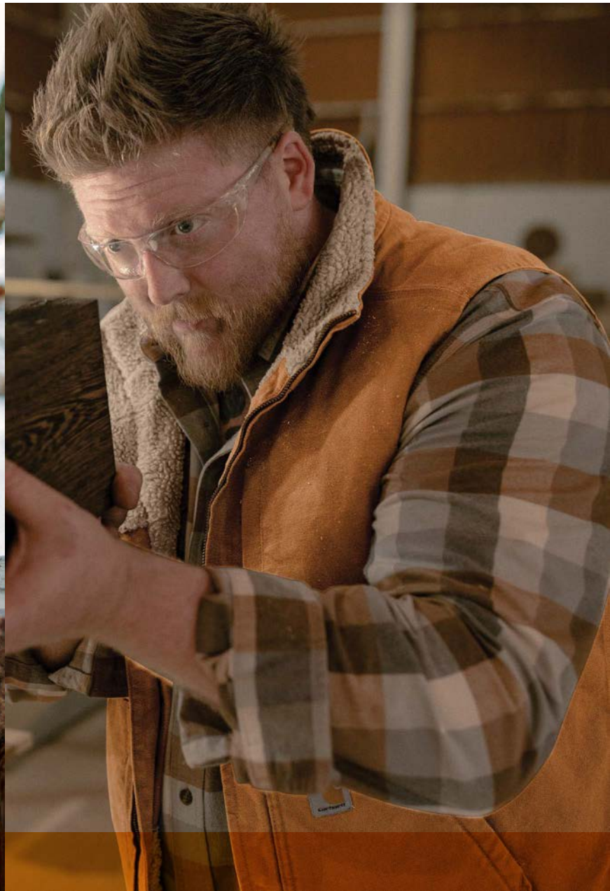
Sherpa-Lined Mock Neck Vest CT104277