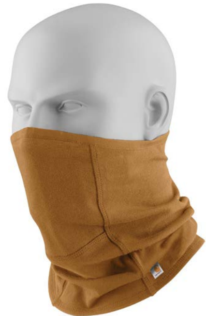
Cotton Blend Filter Pocket Gaiter CT105086