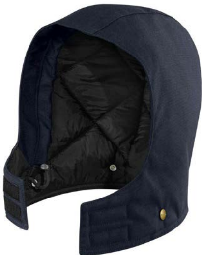
Firm Duck Hood CT102368