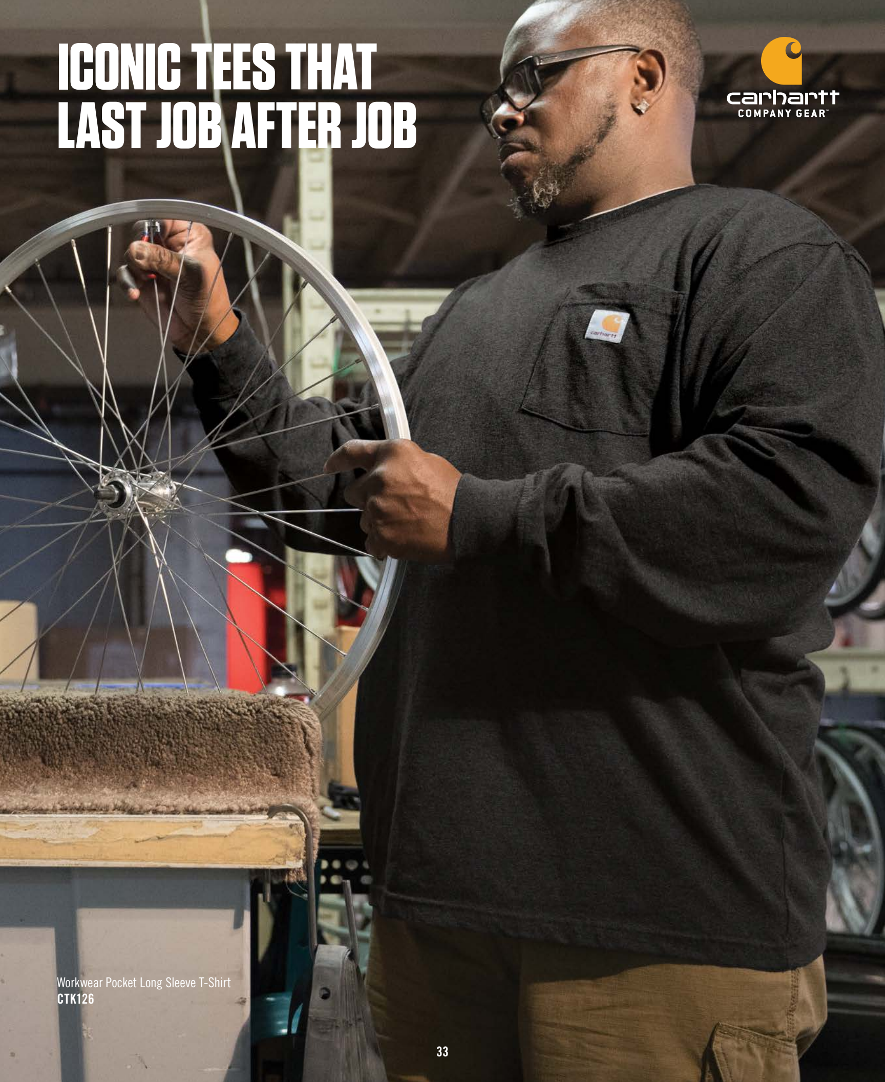
Workwear Pocket Long Sleeve T-Shirt CTK126