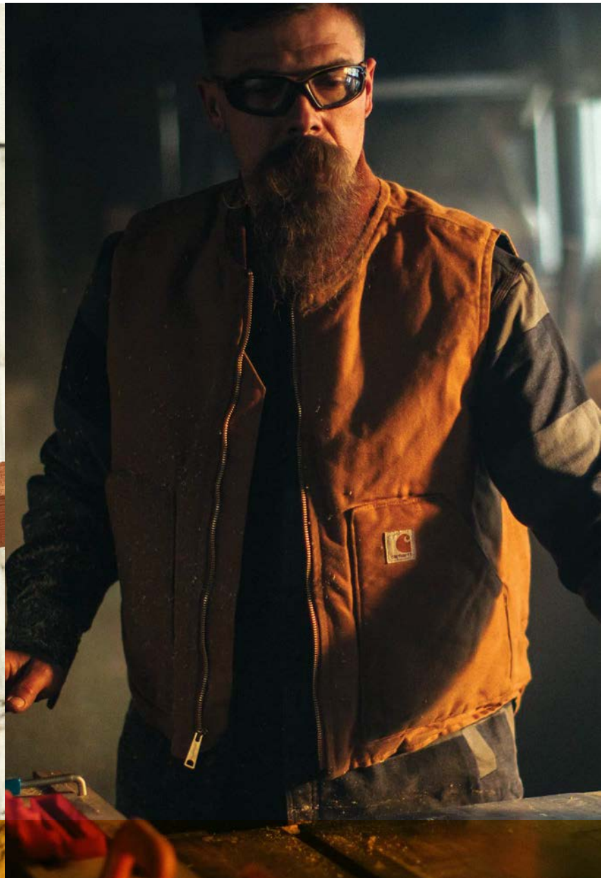
Duck Traditional Coats CTC003 | CTTC003 (Tall)