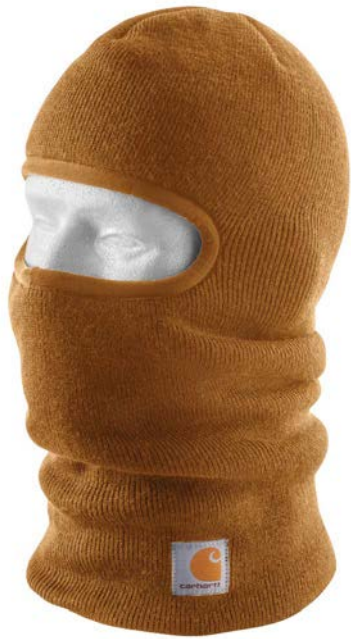
Knit Insulated Face Mask CT104485