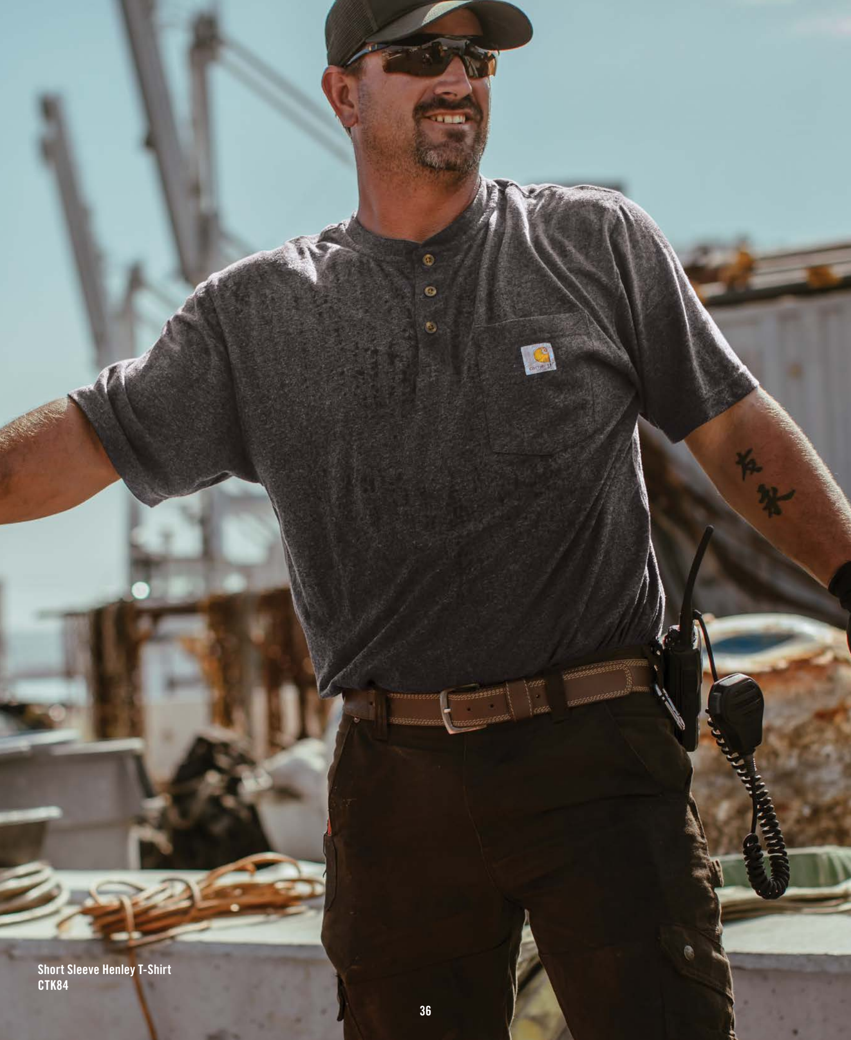
Short Sleeve Henley T-Shirt CTK84