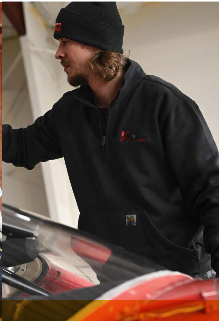
Midweight 1/4-Zip Mock Neck Sweatshirt CT105294